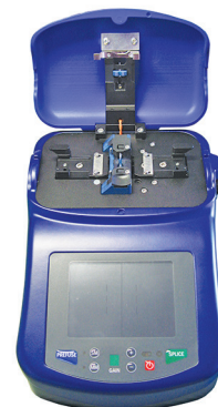
ZEUS D50 Fusion Splicer