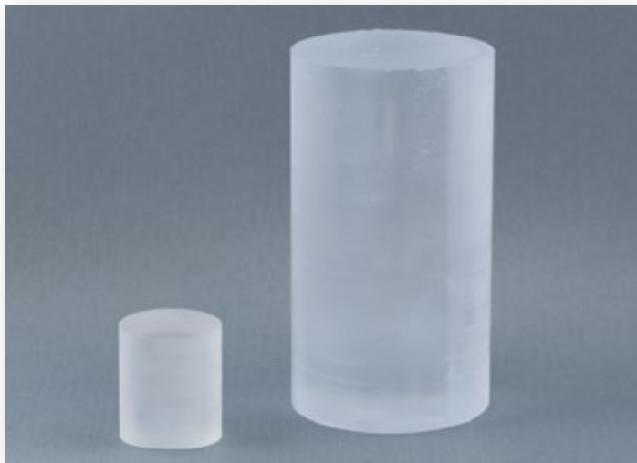
1" and 2" diameter stilbene cylinders