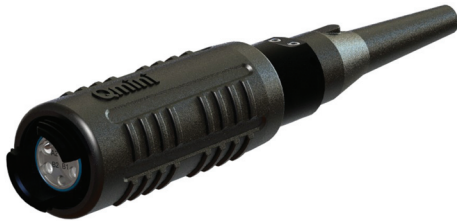
Qmini 2 & 4 Channel Expanded Beam Connector (pictured without dust cover)