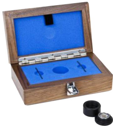
MPX Geometrical Calibration Artefact (Optional)