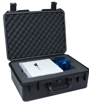
MPX-2 in Carrying Case (Optional)